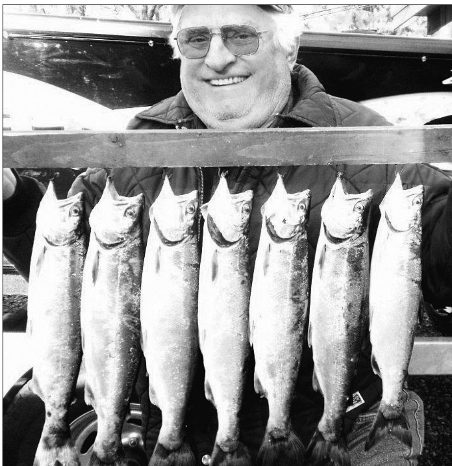
Using a rubber-core sinker 5 feet above a floating Rapala and 40 feet behind a planer board enticed these coho salmon into striking.

Windy conditions tend to draw our fish shallow and close to the shoreline during early ice out conditions. This also allows us to use different colors to produce the