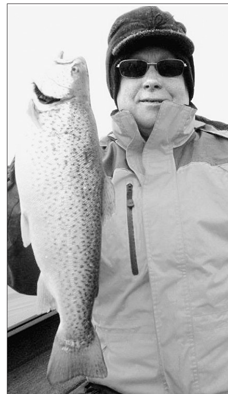
On a cloudy day, an orange Rapala was used to hook this fat brown trout while flat line trolling directly behind the boat.

Fishing shallow at ice out is typical and common along the break walls, inside the harbors and shorelines of the Great