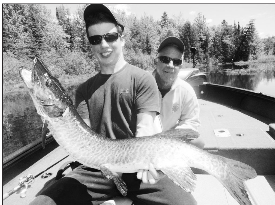
Purposely using light equipment to entice the strike, this muskie was caught on a clear water lake in shallow water.

The top-water baits we are using are also in certain color patterns. For example, instead of a bright orange belly, we prefer a very dark-colored orange. Or instead of just black and white, we like a