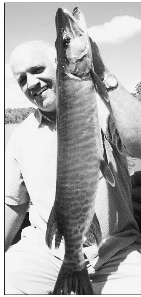
On a warm July day, fishing the weeds produced this muskie on a brown and black rubber bulldog.