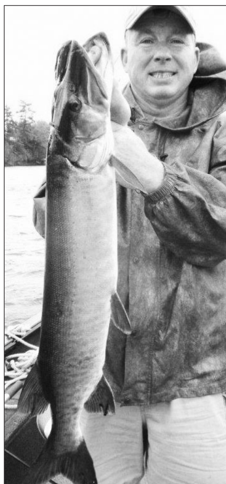
During the light rain and using a top-water bait, this muskie was boated and released in the early morning hours in July.