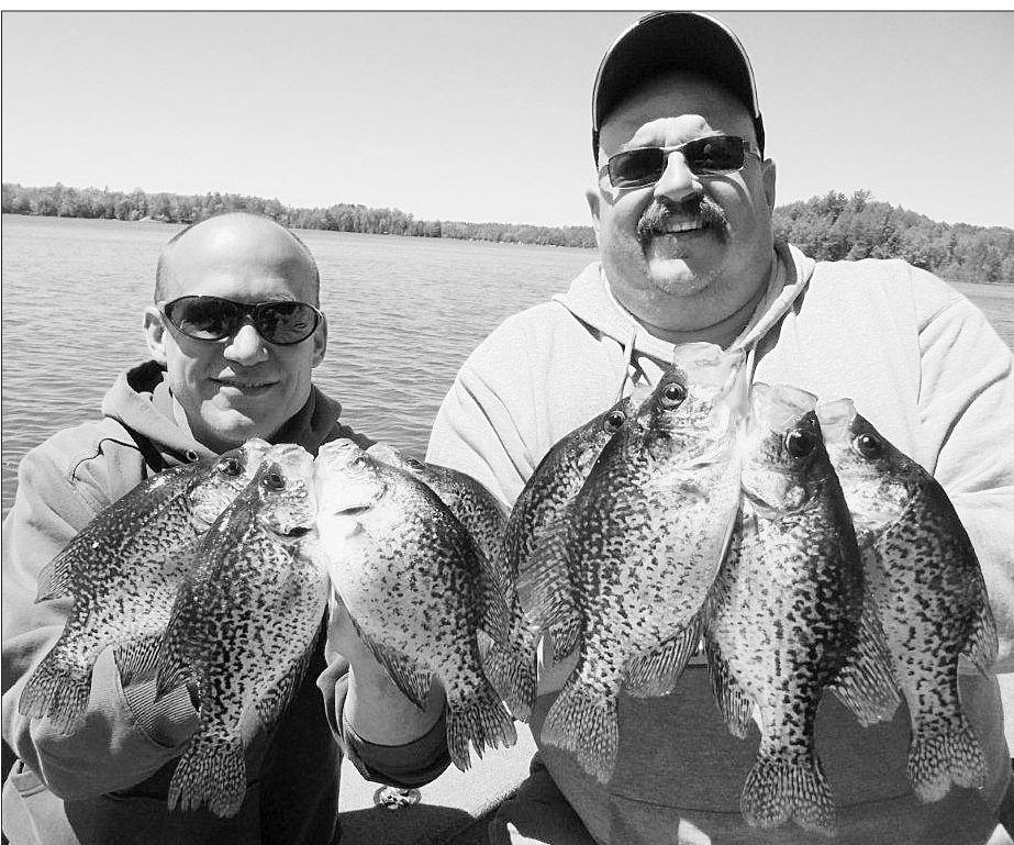
These two brothers caught these crappies while drifting a half mile off shore and casting a jig and minnow.