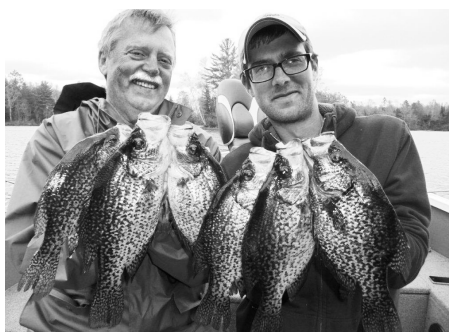
This father and son caught these crappies while drifting with a 1/16-ounce jig a quarter mile off shore over 33 feet of water.

Finding these open water slabs takes fairly good electronics. Being able to accurately present your bait to the fish is very important, for you will need to maintain the correct depth of your bait so the crappies can feel your approaching