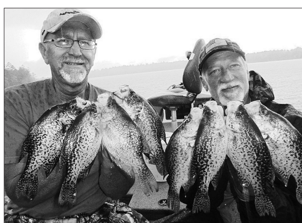
These two brothers enjoyed their day catching suspending crappies over 21 feet of water. They were casting a jig and plastic called a "Nail Tail."

skies and water skiers go roaring by. The fish may move a few feet away, but they continue to bite all day long.